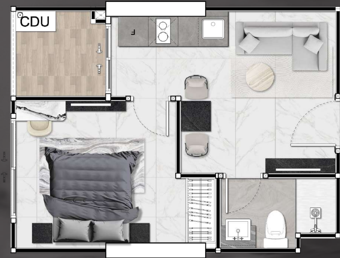
1 Bedroom Type B ( 30 SQ.M. )