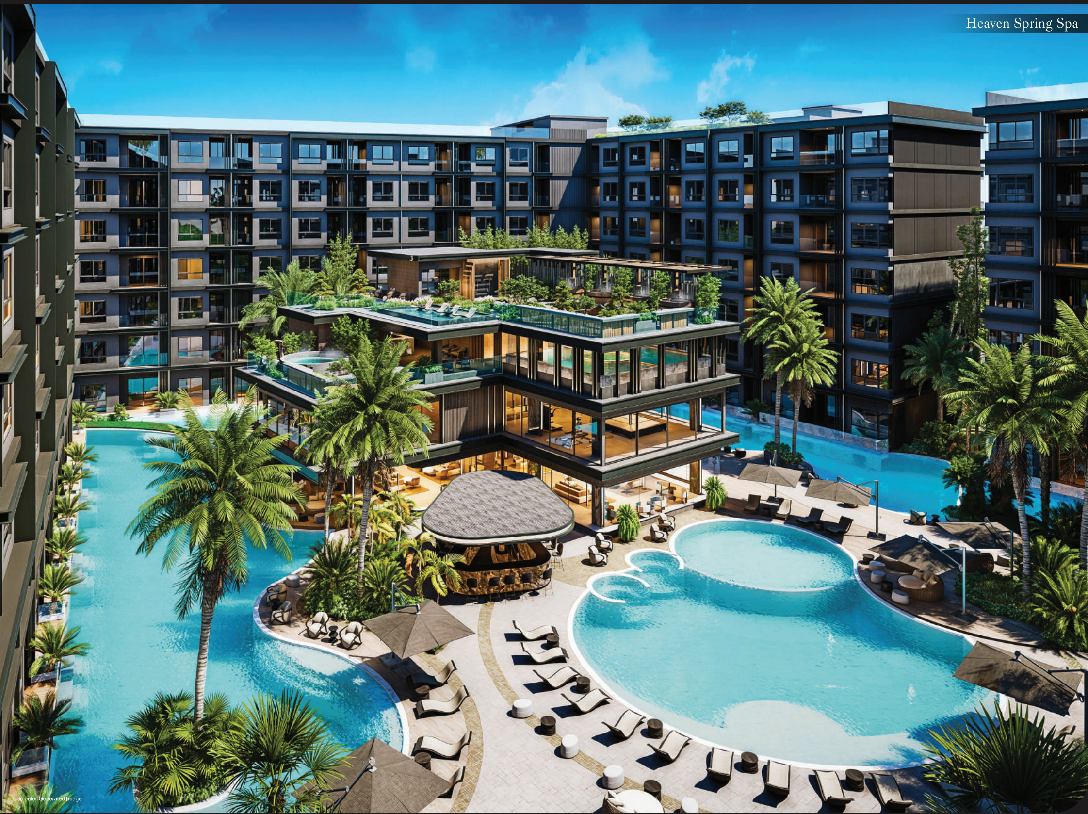
Heaven Spring Spa