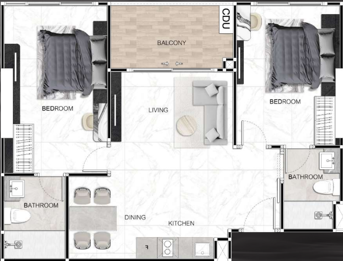
2 Bedroom Type L ( 65 SQ.M. )